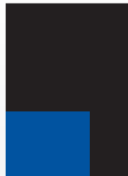
1/3 PAGE SQ. (WxH) 4.50 x 4.625