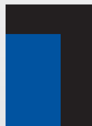
1/2 ISLAND (WxH) 4.5 x 7.375