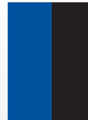
1/2 PAGE VER. (WxH) 3.25 x 9.75