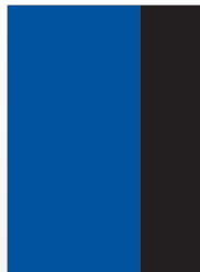
2/3 PAGE (WxH) 4.50 x 9.75

Bleed: Carry bleed 1/8" beyond final trim size 7.875 x 10.75