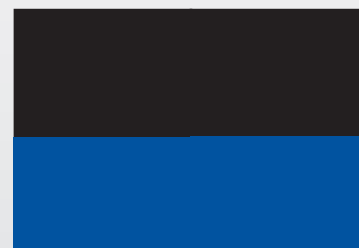
1/2 SPREAD (WxH) 14.75 x 4.625