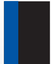
1/3 PAGE VER. (WxH) 2.125 x 9.75