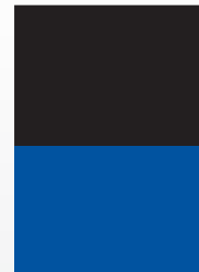
1/2 PAGE HOR. (WxH) 6.875 x 4.625